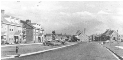
It takes a lot of work to maintain an historical community like Fairlington Commons.

The board is currently addressing several key projects throughout the Commons. Decks, fences, and roofs in the Commons have been surveyed by