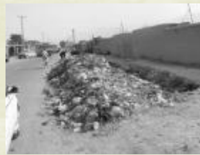
Don't make us look like this! Garbage may be brought out between 9:00PM and 6:00AM before collections.

The board has been assured that AAA/Rainbow will arrive in the Commons