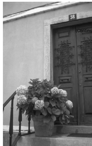
(Continued on Page 3)

There will also soon be a kid-size picnic table in the pool area.