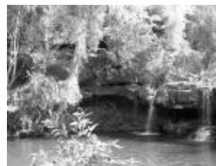
The Fairlington Commons Pool is almost as lush as this scene. With the emphasis on relaxation, you can almost imagine you are in the middle of this.

Regular hours for the pool from 10:30 AM—8:30 PM begin on Monday, June 27. Remember to use the pool as your condo fees support this jewel of Fairlington.